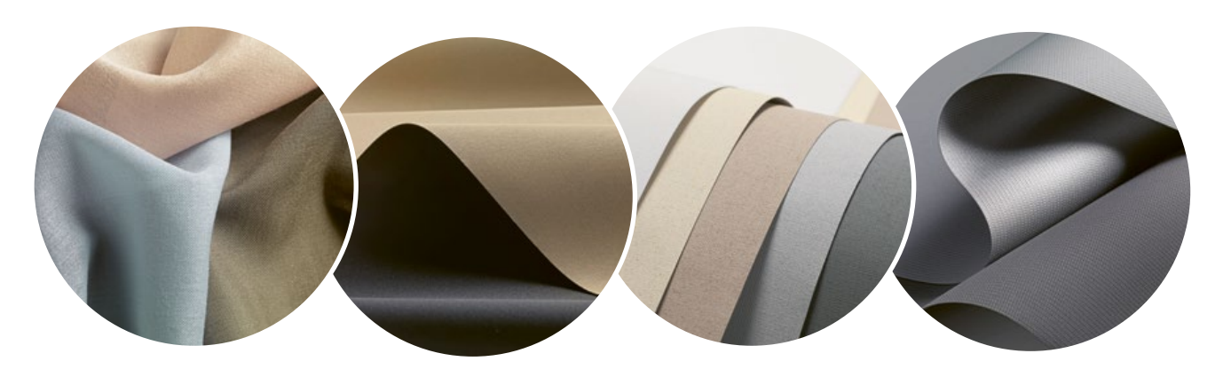
30 colours are available for Colorama 1 and 2

We include fabrics with special functions, acoustic performance, superior light management and environmental considerations. All of our fabrics are flame retardant and have been extensively tested on our systems to ensure consistent hanging behaviour. With such a wide choice, you can be sure to find the perfect fabric for your needs.